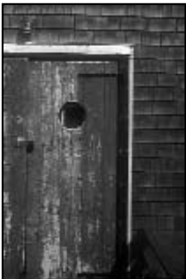
Kathryn Buck, Untitled, No. 2