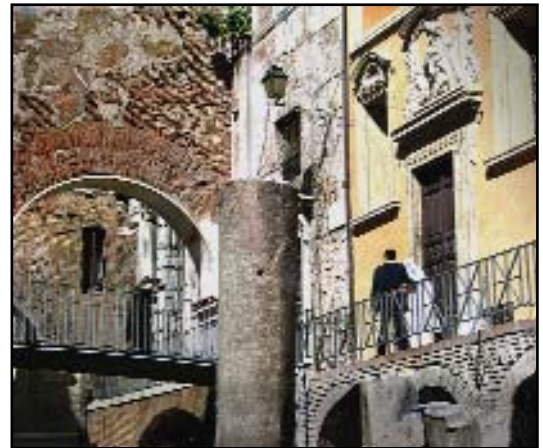
Herb Sandler, Wedding—Italian Style