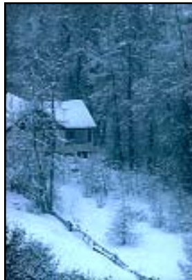
Gilly Safdeye, Snow Scene