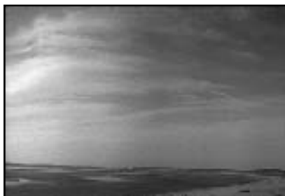
Kathryn Buck, Big Sky—Provincetown , Best Picture of the Night