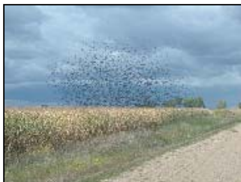
Kathryn Buck, Sun on Corn