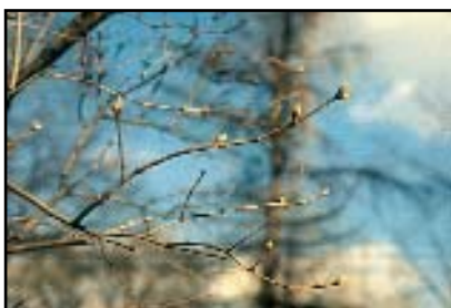
Theresa King, Un-named, No. 1