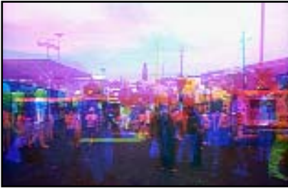
Gilly Safdeye, Flea Market