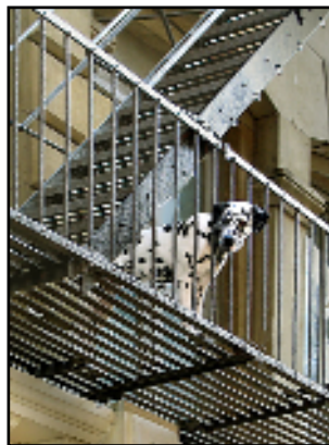
Herb Sandler, Spots