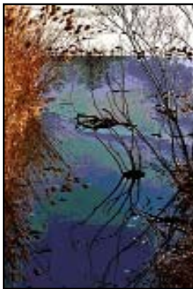
Barbara Raggi, Lake Reflection, No.2, Best Picture of the Night