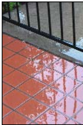
Jeanette Himmel, Reflection—Patio Tiles