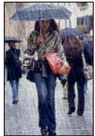
Robert Himmel, Rain in Venice, No. 1

Picture selections based upon space & availability.