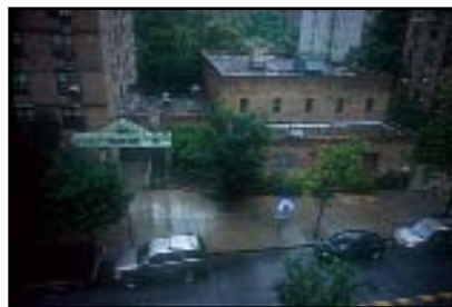
Douglas Braswell, Rainy Day, No. 2