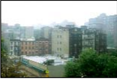
Douglas Braswell, Rainy Day, No. 1 ”