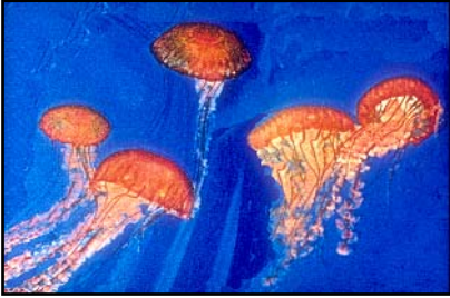
Jeanette Himmel, Jelly Fish