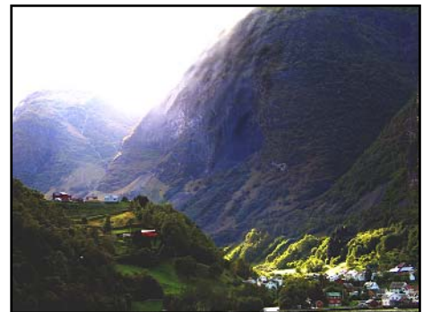
Herb Sandler, Blue Valley Best Picture of the Night