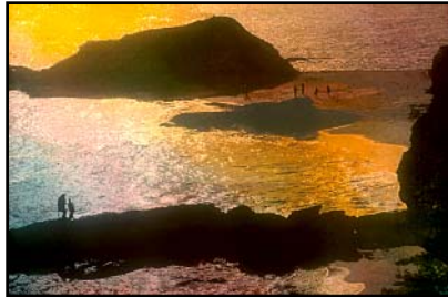
Jeanette Himmel, Laguna Beach