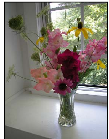
Kathryn Buck, Summer's Harvest