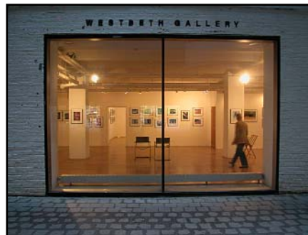
End of the Day