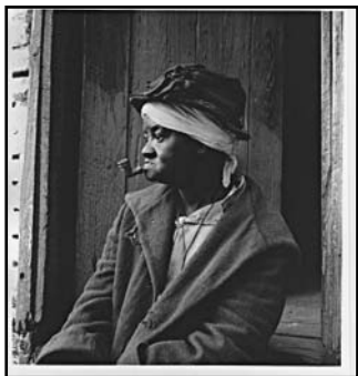
Black Woman by Sophie Lauffer

Prints, Digital images, and Slides (Color, Black-and-White Scala slides) 2 entries for each category. Digital files must be submitted to Bob Himmel by Oct. 21st . Refer to "Submitting Digital Images for PPA Competitions" by Bob Himmel. Note: Please read the new competition rules (page 4) particularly