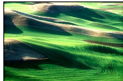
Arlene Stuhl, Rolling Hills