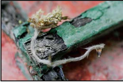
*Theresa King, Found Object, No. 2