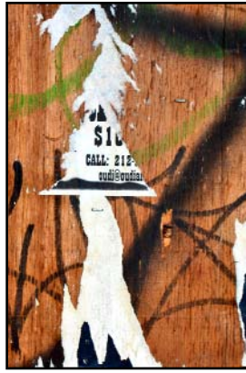
Jeanette Himmel, Billboard, No. 1