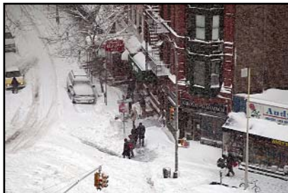
Barbara Raggi, Winter Tableau—Grove Street