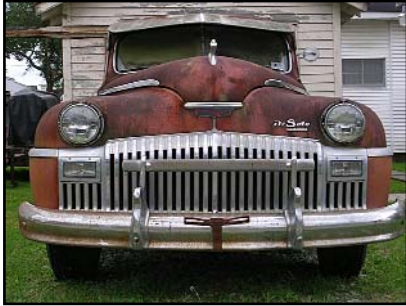
*Kelsey Chauvin, De Soto