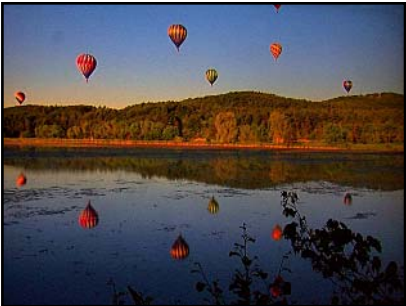
Gilly Safdeye, Balloons