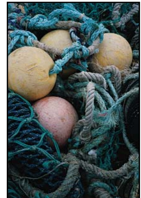
Elisa Decker, Four Balls