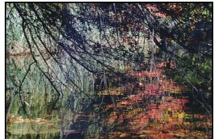
Elisa Decker, Central Park Reflections