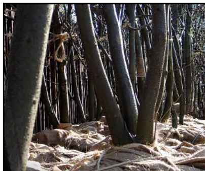
Herb Sandler, Tree Nursery