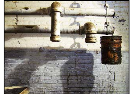
Kelsey Chauvin, Underground Vault