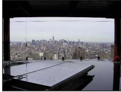
Kelsey Chauvin, View from 7WTC