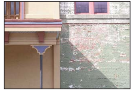
Kelsey Chauvin, Freret Building