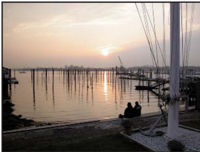
Kathryn Buck, City Island Sunset